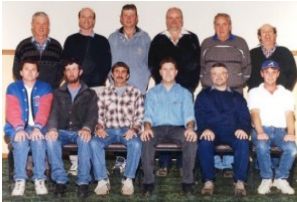
AVOCA FOOTBALL CLUB 1998 SENIOR'S PREMIERS